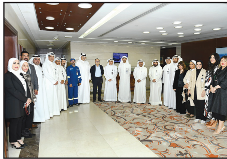
The Acting CEO of the company welcomed a delegation from the Kuwait National Guard