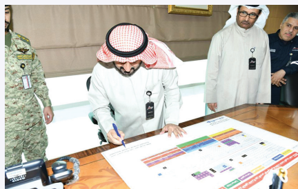
The Acting CEO of the company signs the protocol