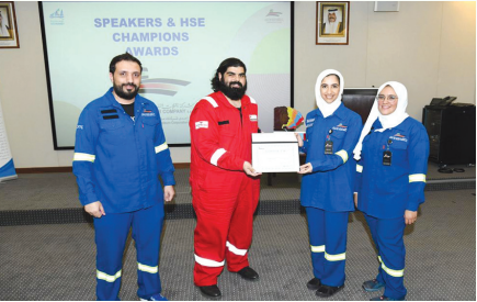
Part From honoring the participants