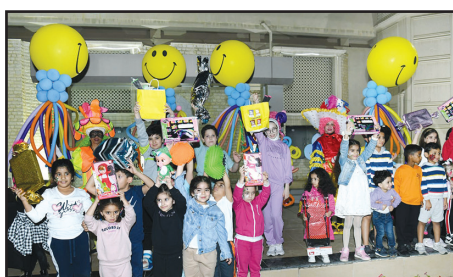
Public Relations and Admin Serv. Group organized the Children's Day Carnival