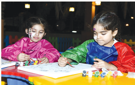
Side of participating