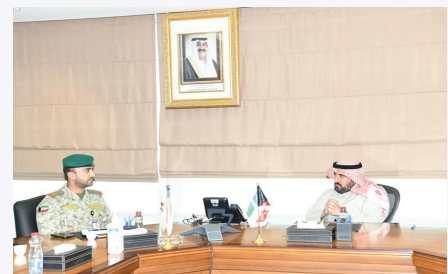
Part of the company's Acting CEO's meeting with representatives of the National Guard