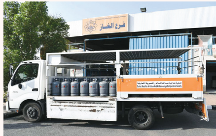
LPG Branch Picture