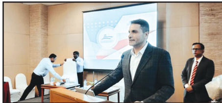
Fleet Operations Group organized a course and workshop for the SIRE 2.0 Maritime Inspection Program