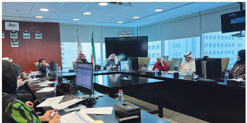
Side of the meeting

The Kuwait Oil Tanker Company, represented by the Comprehensive Risks Department, hosted a meeting on the initiatives of the 2040 strategy to manage the comprehensive risks of the oil sector. Clarifying and discussing issues and data related to the comprehensive risk management of the oil sector, in addition to how to succeed and overcome the obstacles related to the comprehensive risk strategy 2040.