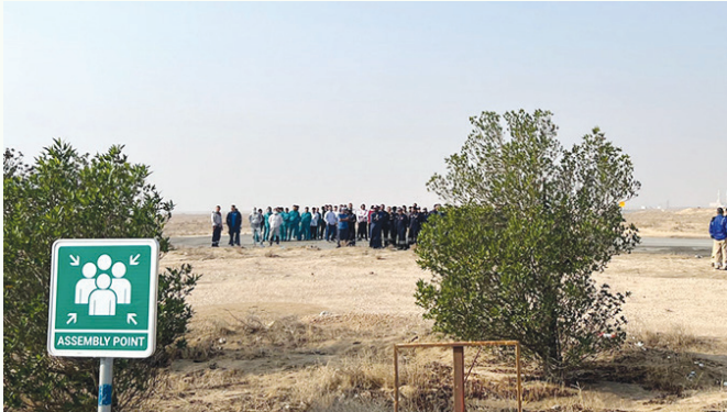
Side of Evacuation