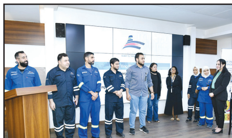
The gas filling branch (Shuaiba) organized a public health and occupational safety day