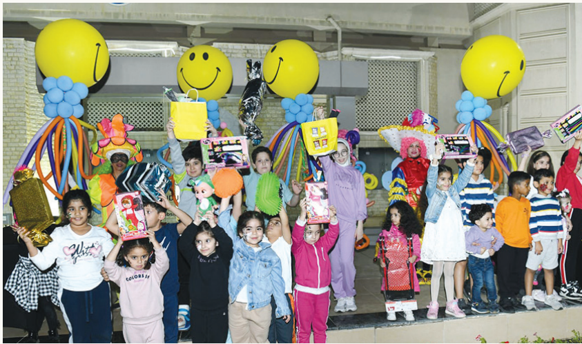
Kids participating in the celebration

The Public Relations and Admin Serv. Group organized on Tuesday evening, November 22, 2022, a Children's Day carnival, it was represented by the Public Relations Team, and for all company's employees and their children. It was in Boubyan Club. The carnival included a different programs that included many entertainment activities and competitions for children and adults, which got the admiration of the attendees and brought joy and fun to all