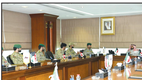
The Acting CEO of the company welcomed a delegation from the Kuwaiti National Guard