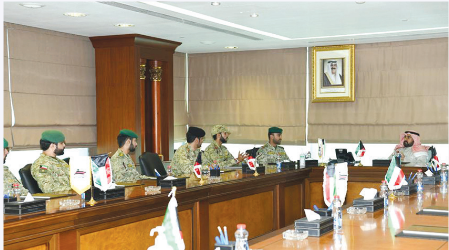
Side of the Meeting

During the meeting, a number of issues of common interest between the two sides were discussed, including cooperation