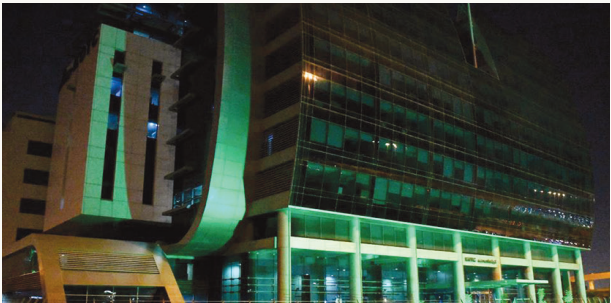
KOTC illuminated their building with green

In Participation of the Kuwait Oil Tankers Company of the Kuwait National Petroleum Company in its celebration of the completion of the fifth liquefied gas line project at Al-Ahmadi Refinery, which is one of the most important projects of the National Petroleum Company after the environmental fuel project. It was celebrated by the National Petroleum Company under the auspices and presence of Sheikh. Nawaf Saud Al-Nasser Al-Sabah, CEO of the Petroleum Corporation