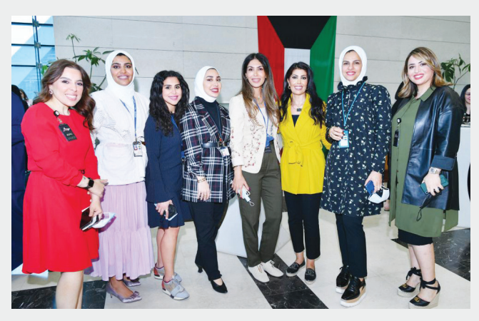
■ group picture