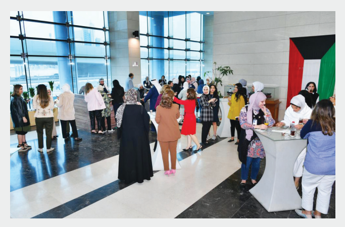
■ part of the celebration