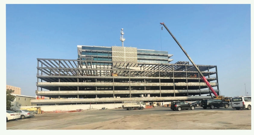
■ Work is under construction of the company's main building car parking project

The Civil Projects Department is currently working on a