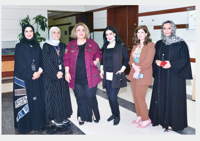
■ group picture