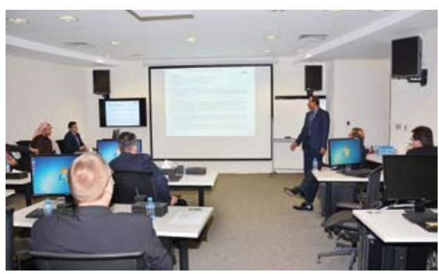
■ A side of the training course activities