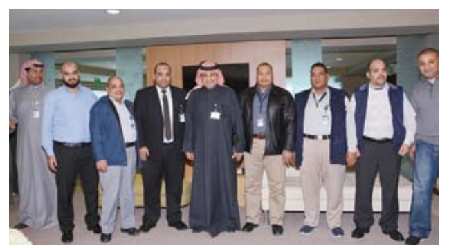
■ In a memorial photo with a number of employees