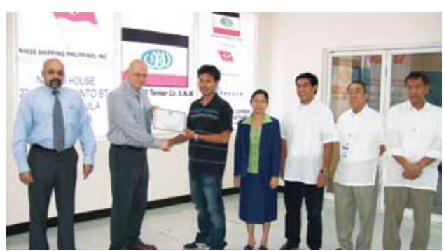
■ During honoring trainees