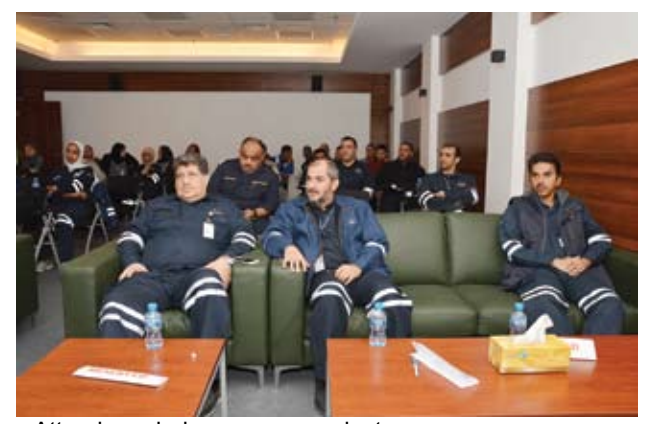
■ Attendees during awareness lectures