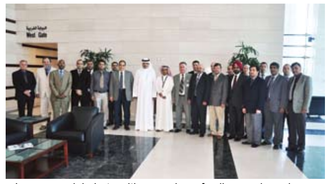
■ In a memorial photo with a number of sailors and employees