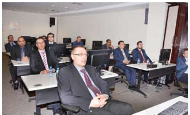
■ Seafarers participating in the lectures