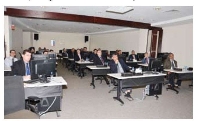
■ A side of the training course attendees