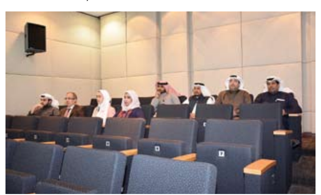
■ A group of employees participating in the lecture

which aims to encourage employees to achieve the basic values such as emphasizing the importance of "employee engagement" in order to achieve certain steps which designed to distinguish the Oil Sector. Referring to the keenness of the project management to avoid the violation of KPC terms and regulations explaining that the benefits of the project is to strengthen the relationship with internal and external public and provide the opportunity for the Oil Sector's employees to exploit the best deals and facilitate the procurement process as well as saving time.