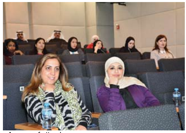
■ A group of attendees

Public Relations & Admin Service Group organized a seminar about "Emtaz" online shopping site launched by KPC to serve 20,000 employees and their families in Oil Sector to reach 100,000 persons, "Emtaz" project to be applied officially on 22<sup>nd</sup> February 2017.