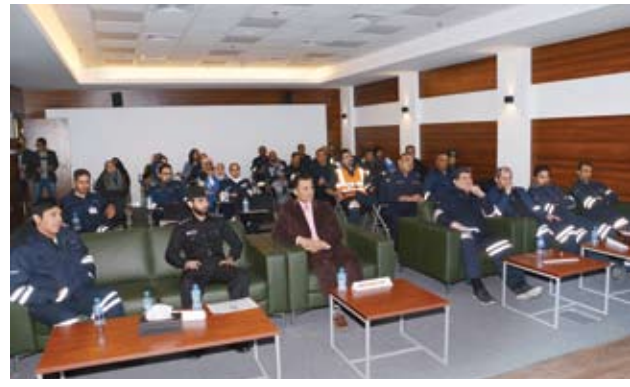
A side of attendees