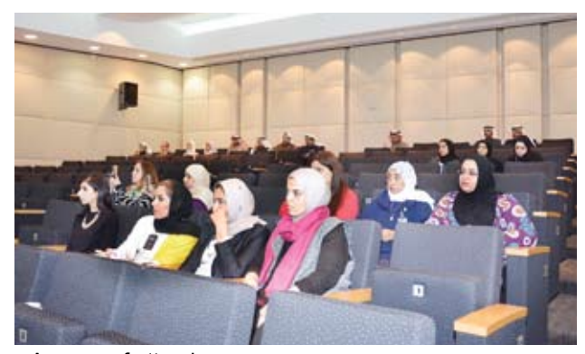
■ A group of attendees