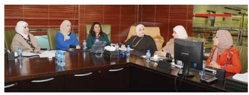
■ A side of the coordination meetings between the company and the Central System for Information Technology

Kuwait Oil Tanker Company inaugurated the E-Correspondence (G2G) project as part of its plan to implement the e-government in coordination with the Central System for Information Technology through AD HOC committee according to the cabinet decision No.412 for the year 2014. in order to apply the system in the company and concerned entities in Oil Sector, in addition to create communication channels with governmental institutions which uses the same system. E-Correspondence G2G system aims to transfer the official correspondence central system to E-Correspondence system to prepare, edit and exchange official letters in addition to storage, tracking and retrieve them to be used on a large scale by various entities as well as providing secure