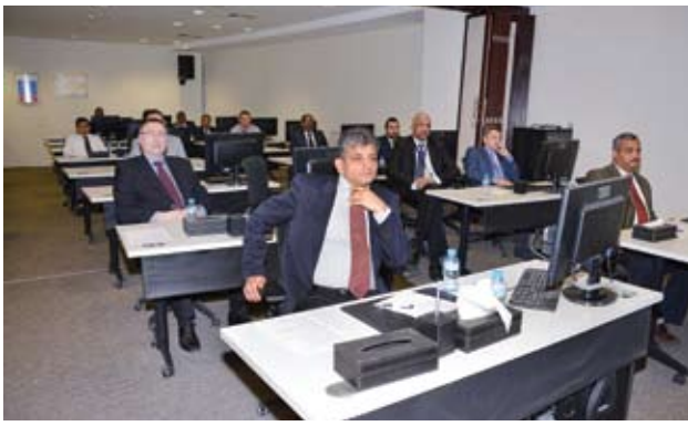
■ A side of participants in the training course