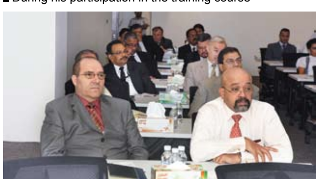
■ Participating in a training course