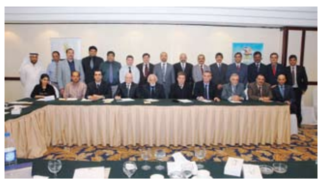
■ In a memorial photo on the sideline of the training course