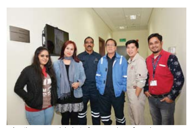
■ Another memorial photo for a number of employees