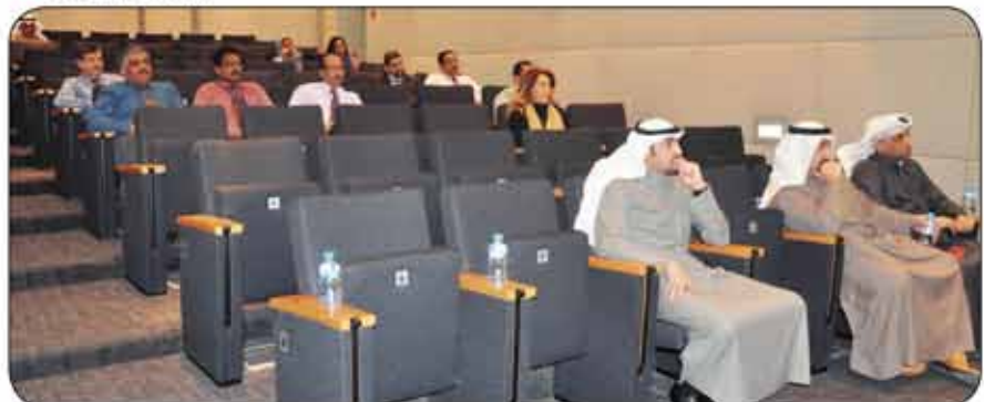
● Another part of the session