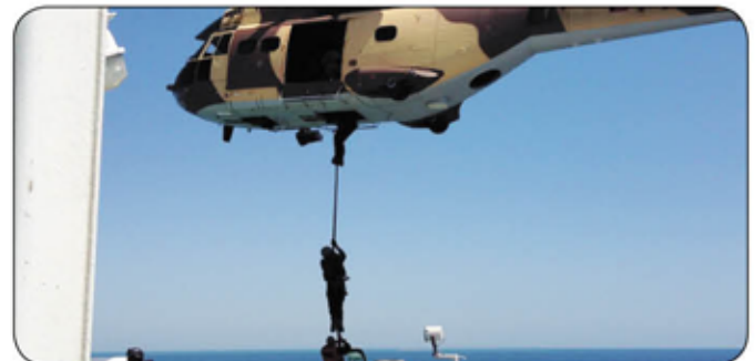
• A helicopter flying over Tanker Hadiya and, security men dealing with the aggressors