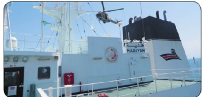
• Part of Tanker Hadiya