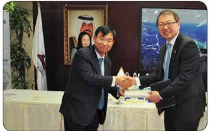
• A view of memorial gift distribution