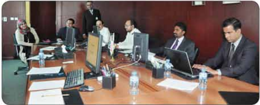
● Part of Oracle work development sessions

Phase II included adding new modules for pushing and improving the performance with precision and better productivity.