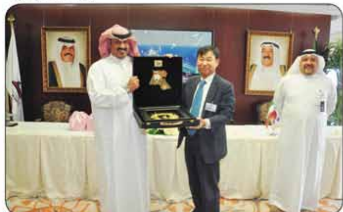
• Sheikh Talal Al-Khaled presenting a guest with a memorial shield