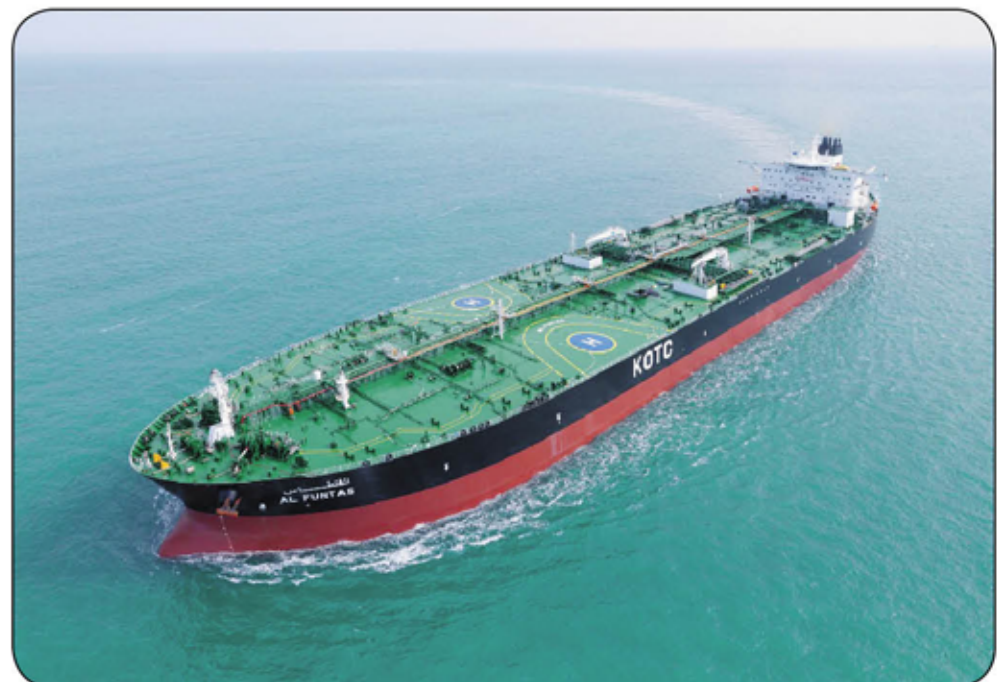
• Tanker Al-Funtas sailing safely