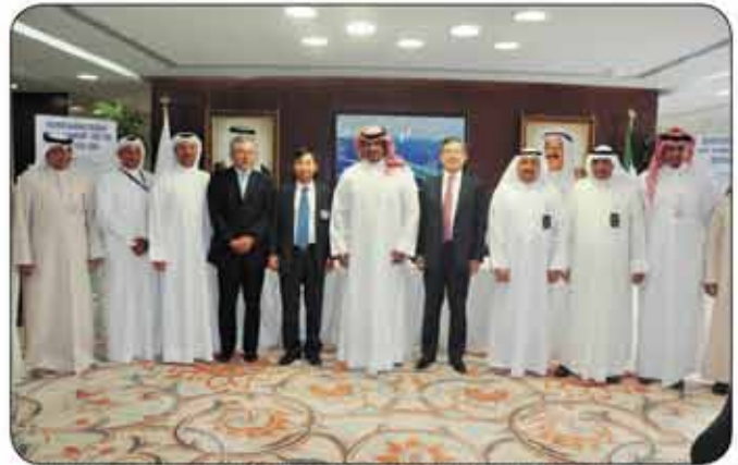
• A memorial shot on the sideline of the ceremony of signing the contract of taking delivery of Tanker Al-Derwazah