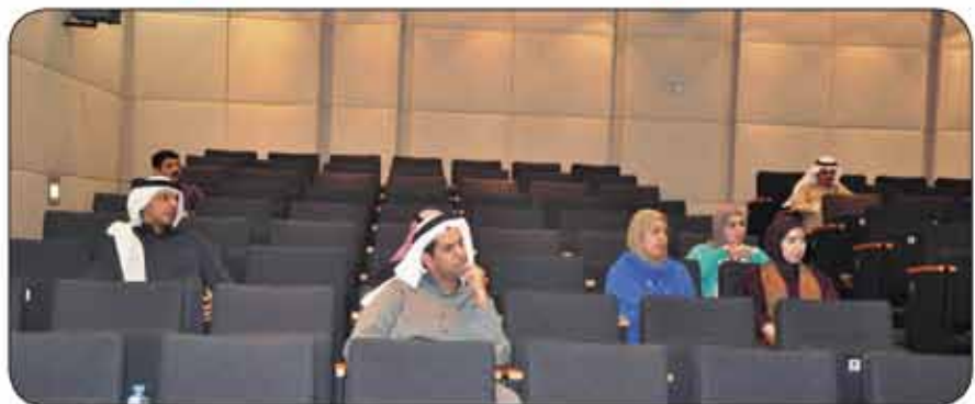
● Part of the session