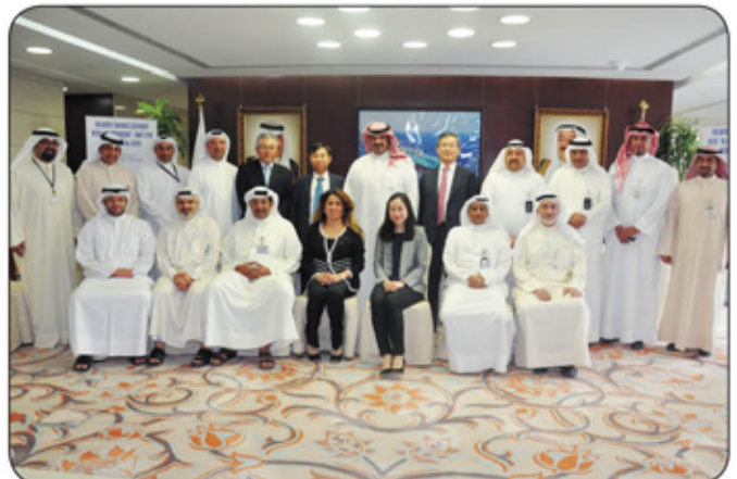
• Participants in the ceremony of signing the contract of taking delivery of Tanker Al-Derwaza in a group shot