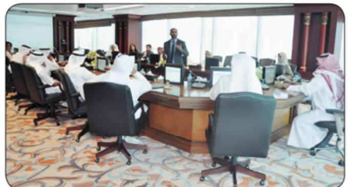
• An Aon Hewitt official reviewing the "career linkage" questionnaire results