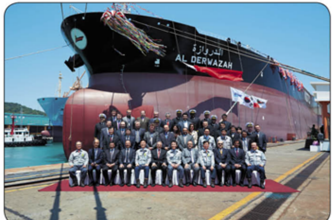
• A group shot on the sideline of the ceremony of naming Tanker Al-Derwaza in the S. Korean island of Kuji