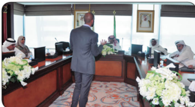
• Part of reviewing the results of the "career linkage" questionnaire

It is recalled that the career linkage project concentrates on giving attention to human element and views it as the basic pillar of all development, progress and construction factors in the oil sector. The 1st stage of this project that kicked off in 2009 yielded many positive results that contributed effectively to improving the career linkage levels and creating many changes in the work environment, which gave the employees a strong momentum to participate in the 2nd stage of the project, express their opinions and present their suggestions which will be taken into account before bringing them to practice.