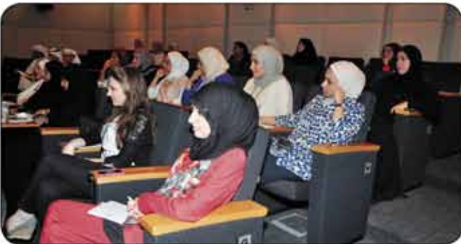
• Noticeable female presence