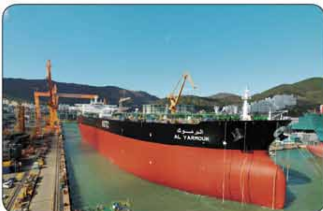
• Tanker Yarmouk in Daewoo Shipbuilding Drydock in S. Korea