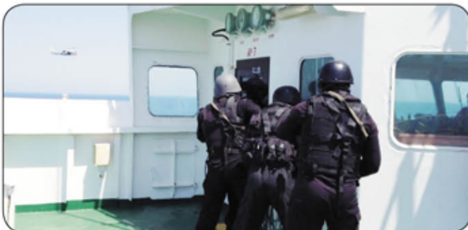
• Security men succeeded in liberating the hostages according to the virtual scenario of the training maneuver