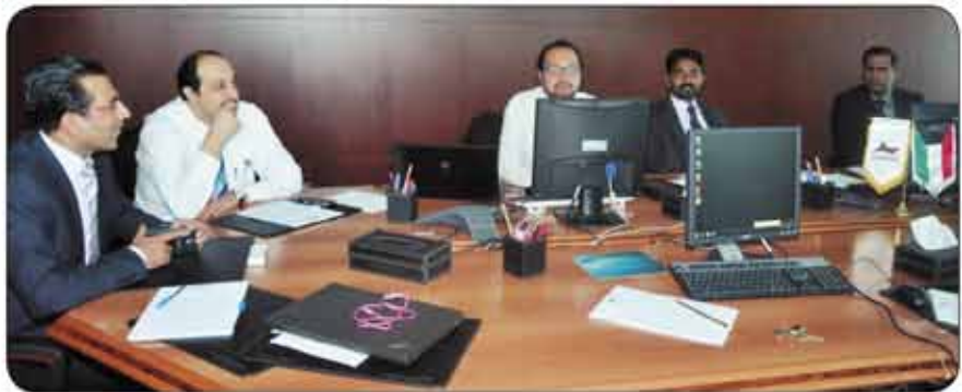
● Another part of the session