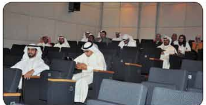
• Another rpart of the attendance