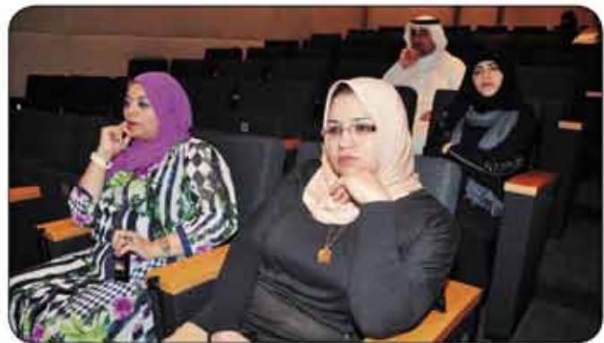
• Part of the attendance