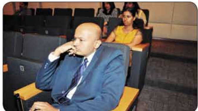
• Another part of the attendance