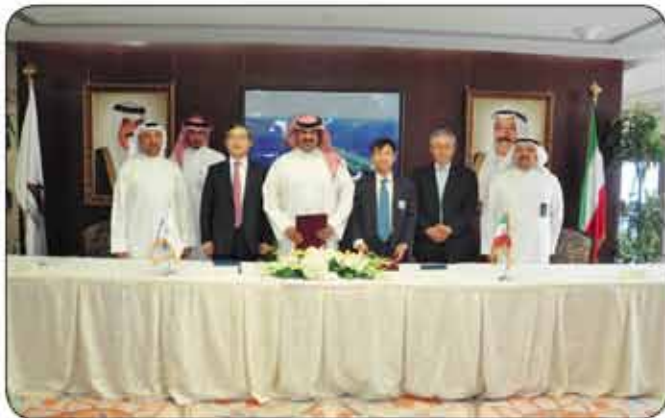
• A memorial shot after signing the contract of taking delivery of Tanker Al-Derwazah