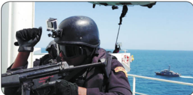
• Part of the training maneuver

This is the second maneuver within the series of joint trainings between KOTC and the parties concerned. Similar joint trainings were conducted successfully in 2013.