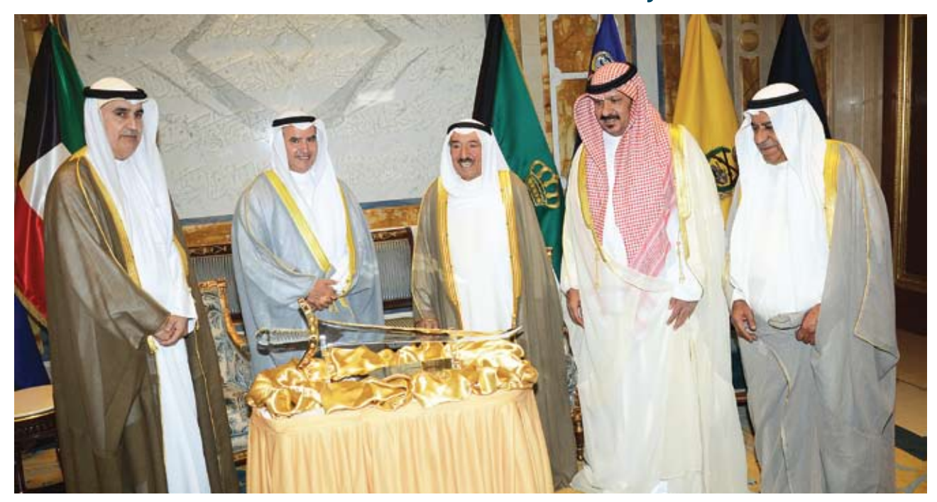
The Crown Prince Commends the Sincere Efforts to Strengthen KOTC's Progress and Establish its Regional and International Status