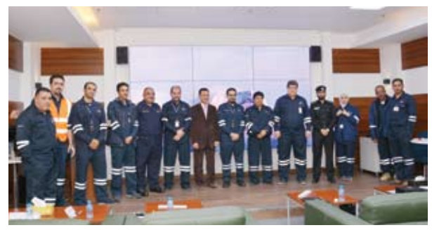
Training the Employees on ISO 50001 Energy Management System