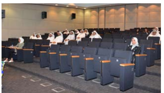
■ Part of participants