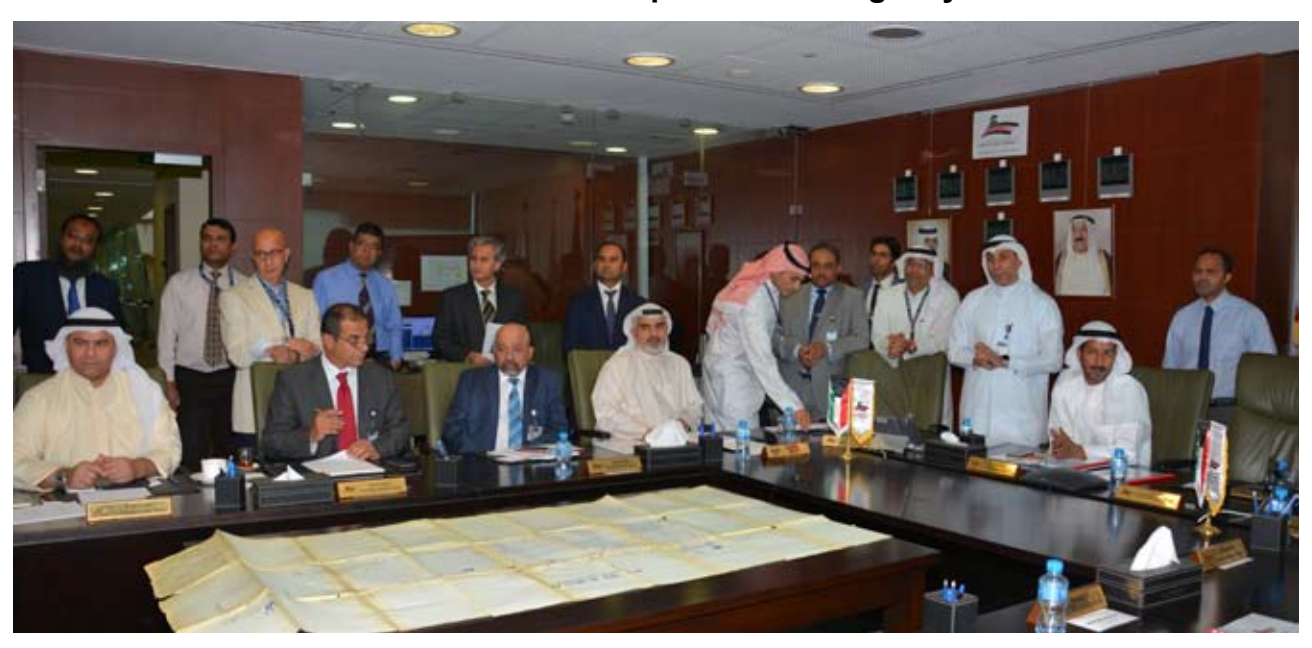
■ Participants inside Emergency Room following up the Gas Al-Mutlaa tanker accident drill

In line with the company policy in improving safety procedures on board the tankers, Fleet Operations Group conducted an emergency response drill on board the vessel Gas Al-Mutlaa; in cooperation with representatives from KOTC groups and KPC delegate who participated in the drill. The scenario of the incident involved Gas Al-Mutlaa tanker while it was waiting to load a cargo at Al-Fujaira port, UAE. Another ship collided with her when it was passing nearby. The captain lost control and crashed into Gas Al-Mutlaa at port side causing a 2 Sqm hole in the hull 6 meter below waterline. This caused the seawater got into the vessel with high force; the cargo tank was moved and cracked due to continuous flow of the seawater and vessel stalled