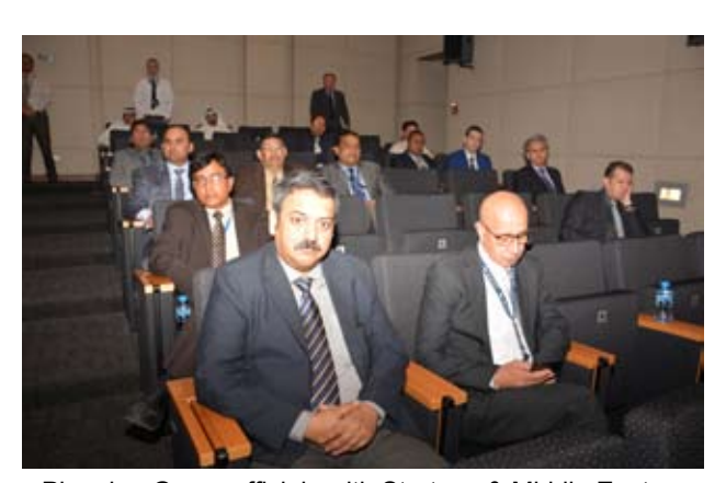
■ Planning Group officials with Strategy & Middle East

audience with their expertise and best practices of the insurance market regarding the mentioned points. Concerned employees attended the workshop from Fleet Engineering Group, Fleet Operations Group, Fleet Personnel Group and Financial Group. It is worth mentioning that UK P&I Club is one of the world oldest protection and indemnity clubs, which cover third-party liabilities. Currently, 16 vessels of KOTC are insured by UK P&I Club.