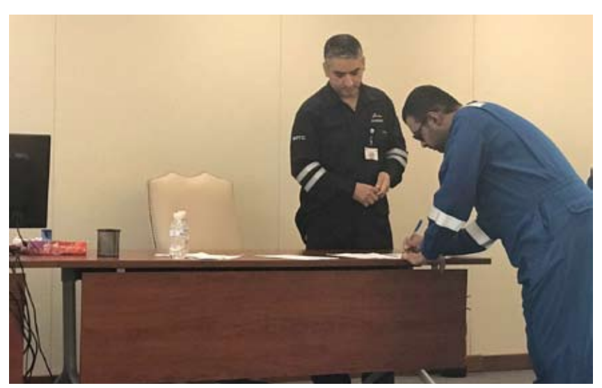
■ An employee at Um Al-Aish LPG Branch registers in the campaign