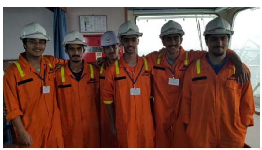
■ Students of Marine Scholarship at a sea trip

The fact that KOTC received the effective company award in instructing and training of marine leaders at Dubai-MARACAD 2016 conference proves the success of KOTC strategy in adopting