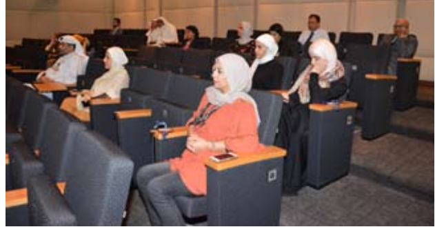
■ Part of attendance