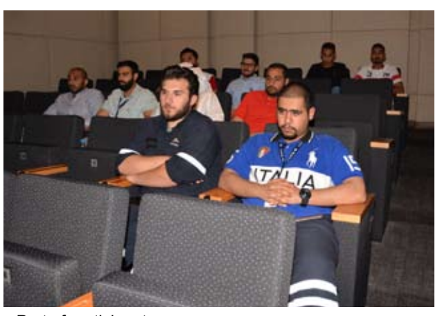
■ Part of participants