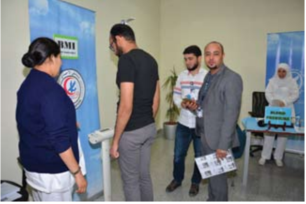
Employees at medical check-up