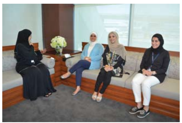
Female-employees at the reception