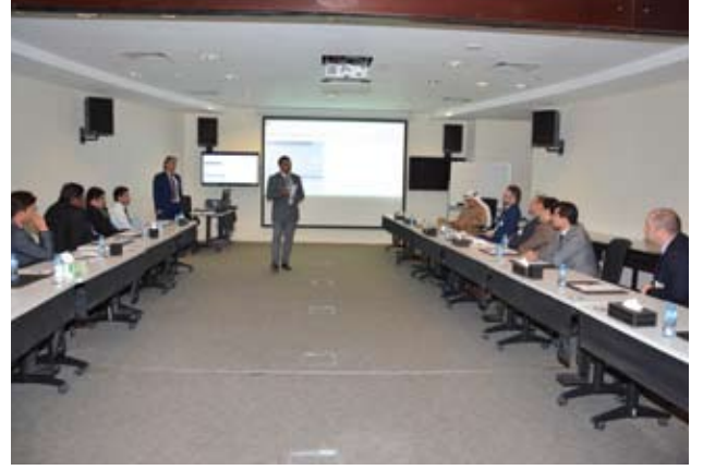
Part of the training course

trainees, locate the gaps and shortcomings in order to fulfil and meet the trainings needs. Due to the positive reaction shown by the marine staff trainees working on board of the Company fleet tankers, further training courses and seminars will be organized.