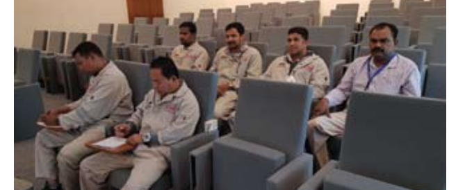
Drivers at the training

A number of Um-Al-Aish drivers Human Resources & Career Development Group organized a 9-day training course for drivers working in LPG Filling Branches of Um Al-Aish and Shuaiba. The 3-day weekly driving courses at LPG Um Al-Aish