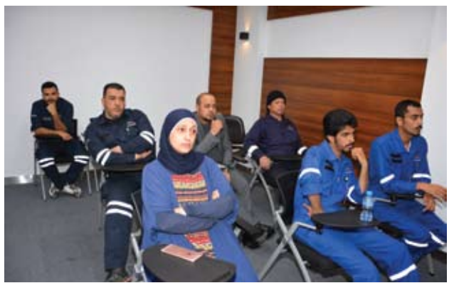
Employees participating in the Health Day