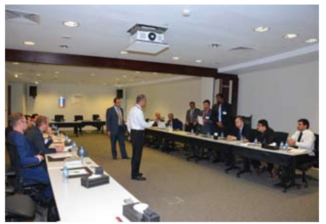
Discussion with officers and engineers