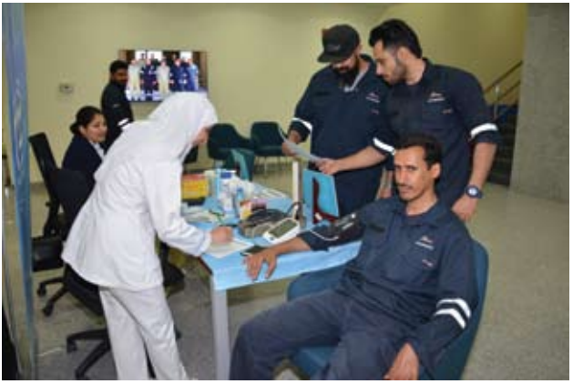
Employees at medical check-up