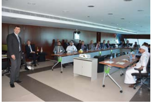
At the training course