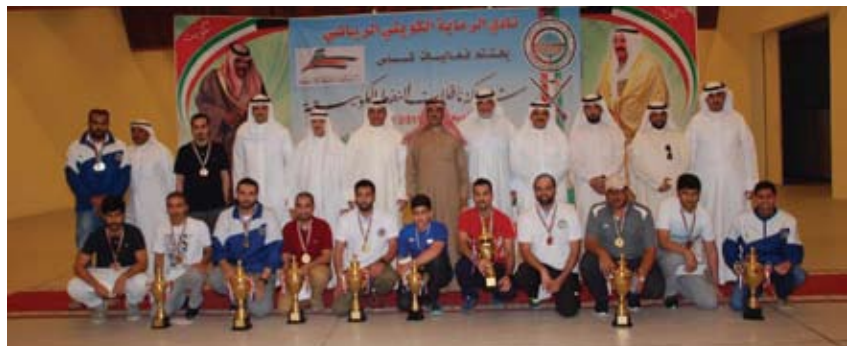
■ Group photo with the winners of the KOTC's championship