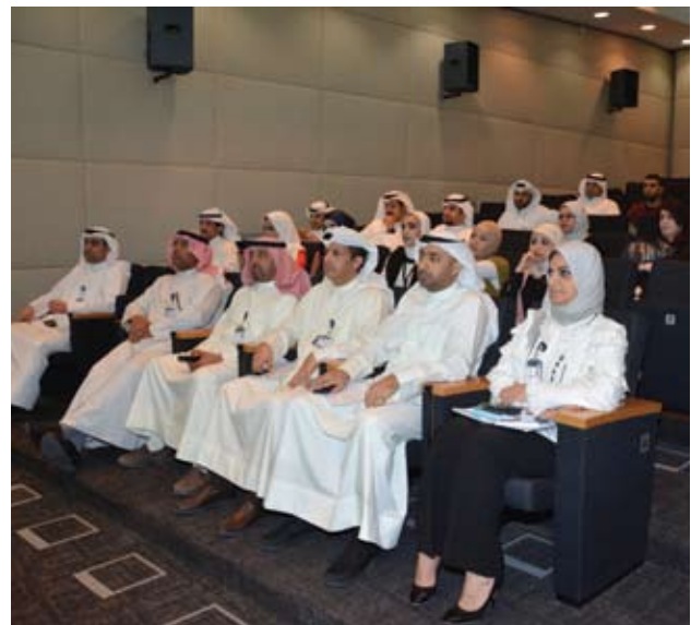
■ Participants in the seminar listening attentively to the presented information