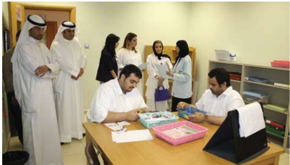
■ The company's delegation listening to the activities of Kuwait Center for Autism