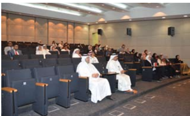
■ Another side of the lecture participants