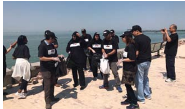
■ The company's team participating in the voluntary campaign to clean Souq Sharq shore

FOG staff then picked up the carelessly thrown garbage of a significant part of the beach from and learnt a valuable lesson on protecting our environment.