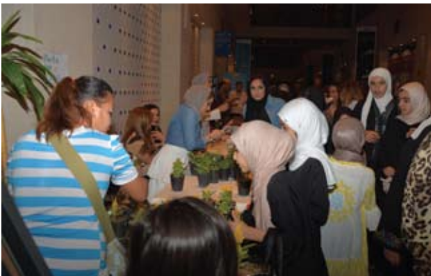
■ A great attendance at the company's corner at the scientific center