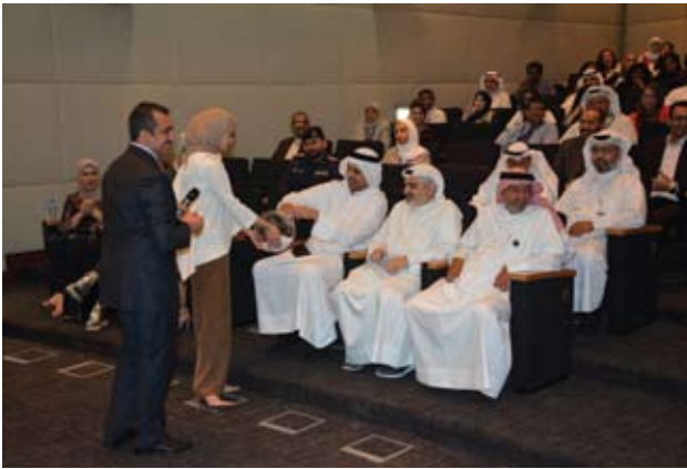
■ A withdrawal of prizes presented to employees