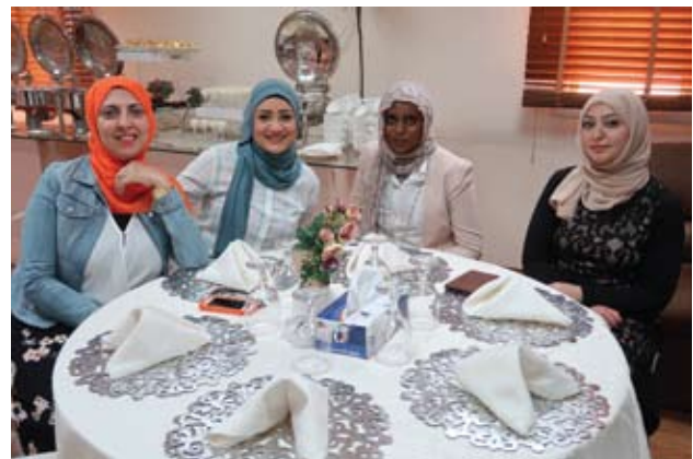
■ A group of Marine Agency employees