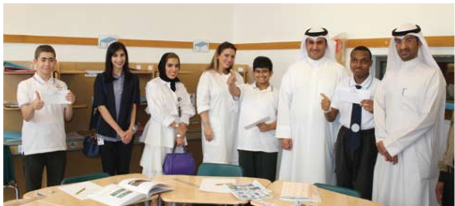
■ Memorial Photo with a number of children of Kuwait Center for Autism