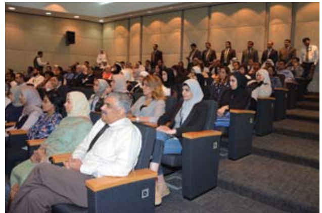
■ Another side of attendees