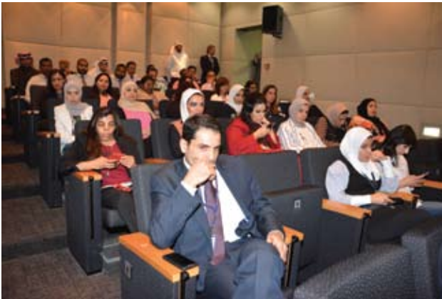
■ A side of attendees