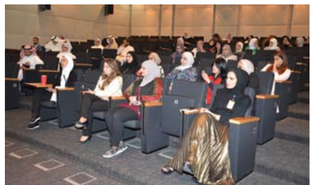
■ A side of the lecture participants