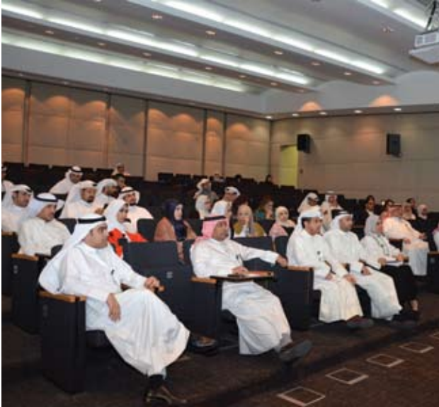
■ A side of the participants in the seminar