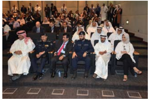
■ A group of attendees