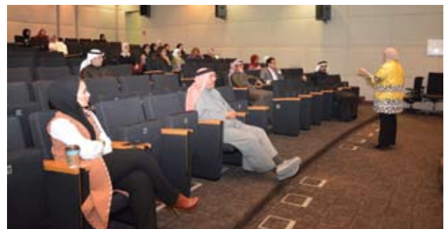
■ A side of the lecture activities