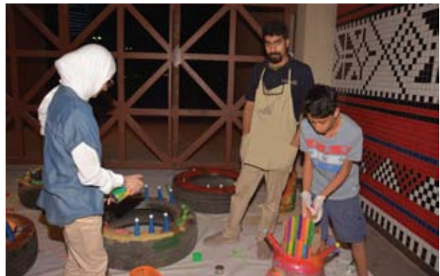
■ A side of the exhibition which organized by the company