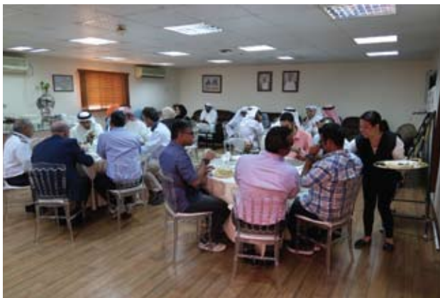
■ A side of Quraish ceremony, which organized by Marine Agency employees

employees from Marine Agency Branch who shared a number of dishes and meals that were related to this Kuwaiti annual occasion of receiving the holy month of Ramadan.