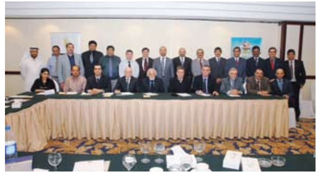
■ In a memorial photo on the sideline of the training course