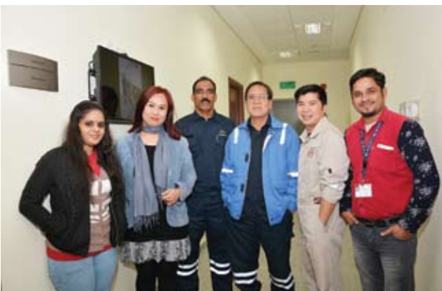
■ Another memorial photo for a number of employees