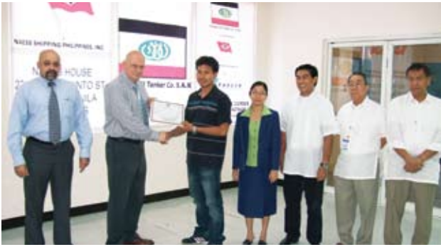
■ During honoring trainees