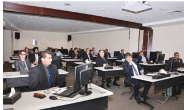
■ A side of attendees