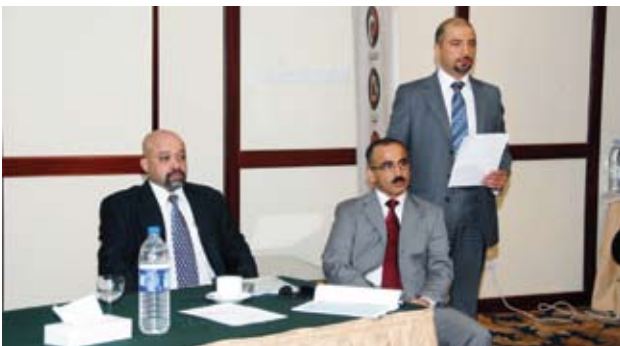
■ During his participation in the training course