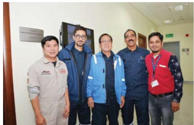
■ A number of employees in a memorial photo