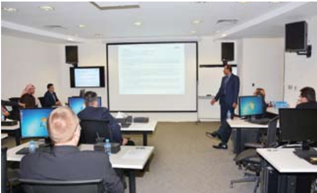
■ A side of the training course activities