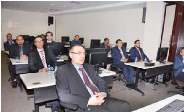
■ Seafarers participating in the lectures