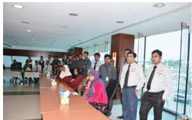
■ A number of attendees in the awareness lectures