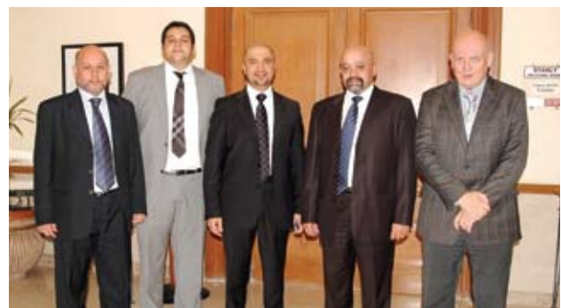
■ In a memorial photo