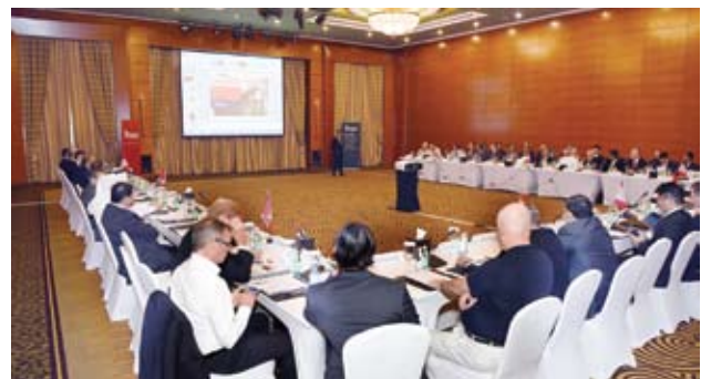
■ The discussion panel of the ABS forum