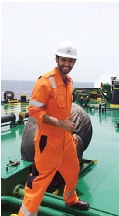
■ During safety and security drills

attendance in addition to the moral support through visits, permanent communication, follow-up, care, and the spirit of one family which gives us the strength to accomplish and graduate on time. He explained that the company has granted his post-graduate employment where he was appointed as Third Officer referring that he aspires to