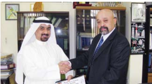
■ With one of participants in the training course