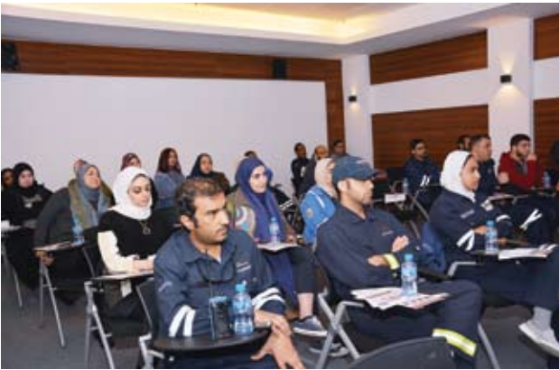
■ A side of attendees