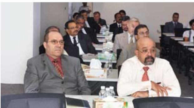
■ Participating in a training course