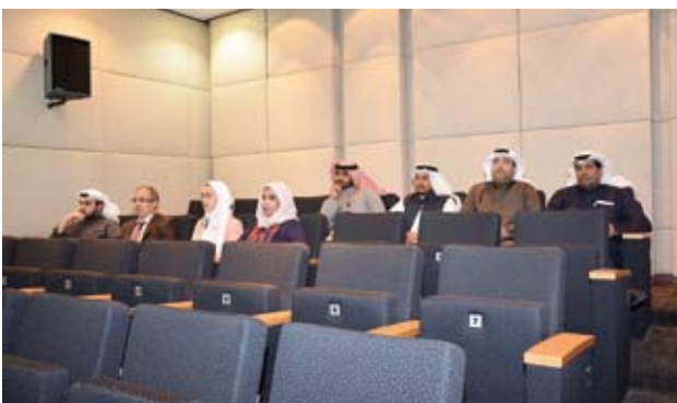
■ A group of employees participating in the lecture