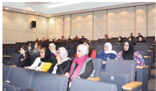
■ A group of attendees