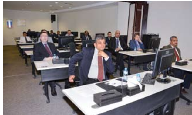
■ A side of participants in the training course