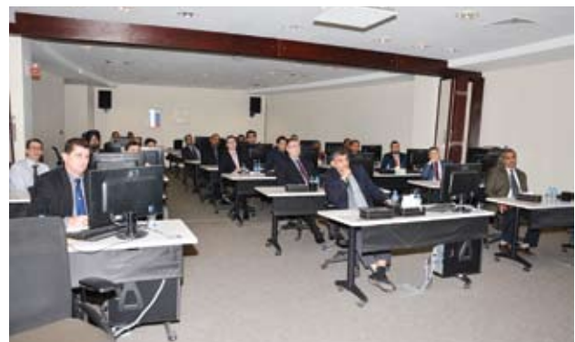
■ A side of the training course attendees