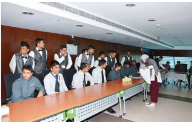
■ During training of the building's evacuation plan

In order to support evacuation plan in emergencies. Lectures included detailed review for the evacuation plan through safe stairs and their locations up to assembly points and organization chart for emergency team as well as their responsibilities.