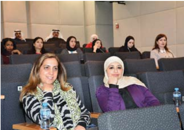
■ A group of attendees

Public Relations & Admin Service Group organized a seminar about “Emtaz” online shopping site launched by KPC to serve 20,000 employees and their families in Oil Sector to reach 100,000 persons, “Emtaz” project to be applied officially on 22 nd February 2017.