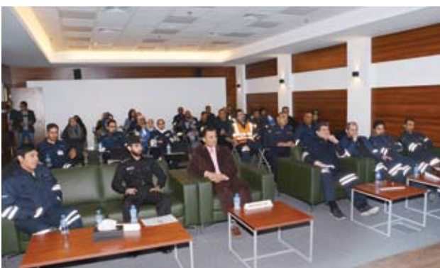
■ A side of attendees