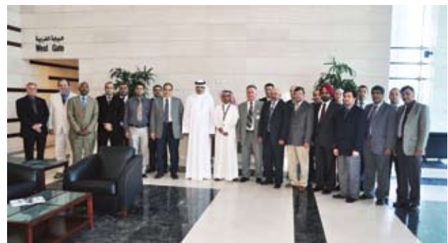
■ In a memorial photo with a number of sailors and employees