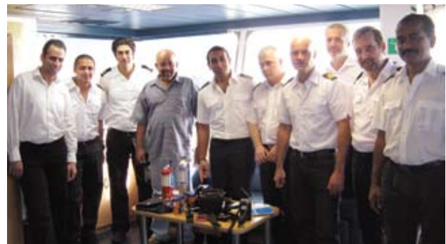
■ With one of the fleet vessel's crew