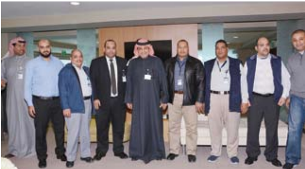
■ In a memorial photo with a number of employees