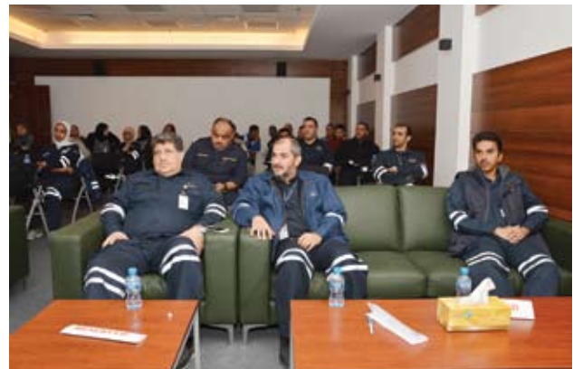
■ Attendees during awareness lectures