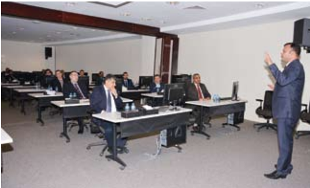
■ A side of the training course lectures