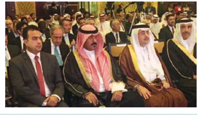
KOTC participated in 7th HR gathering