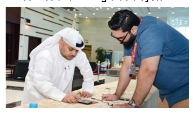
KOTC celebrated national days with the employees