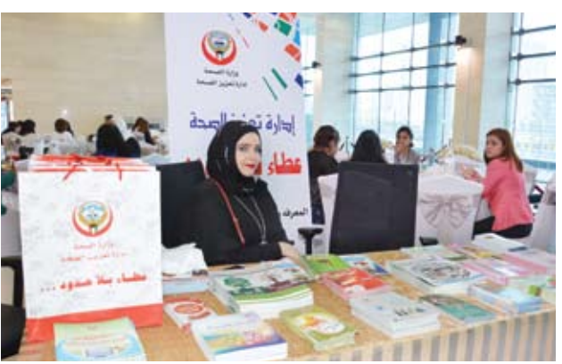
■ Participation of Health Promotion Department in the health awareness day