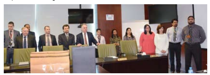
■ A group of employees participating in the farewell party