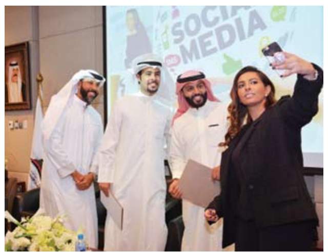
■ Participants of the seminar, in a selfie photo