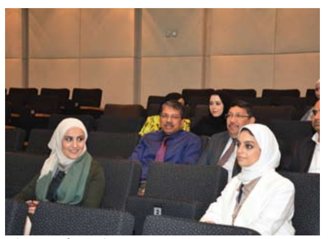
■ A group of attendance