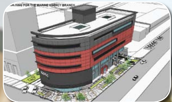
New Administration Building Project for Marine Agency Branch