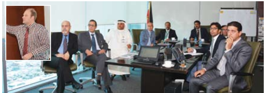
■ Side of the lecture and in the frame the representative of DNV GL

Fleet Engineering Group in KOTC, started to conduct and implement “ShipManager-Hull”, prepared by DNV GL (The World’s leading Classification Society and a Recognized Advisor for the Maritime Industry), to be implemented on the latest nine fleet tankers, which classified as “4 x VLCC’s, 4 X MR’s, 1 X Aframax”. ShipManager Hull Vessel-specific 3D models, is the most advanced hull integrity management software available, for maintenance strategy, planning, inspections, hull surveys, assessments and documentation. Enable visualization and assessment of hull structural