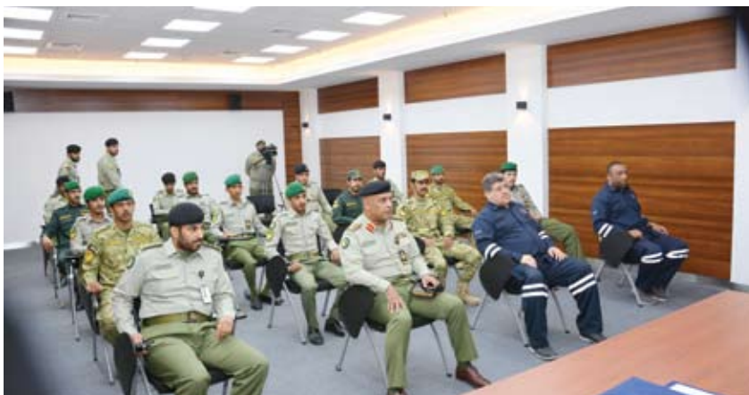
■ Officials of LPG Filling Branch "Shuaiba" & National Guard Affiliated in the honoring ceremony