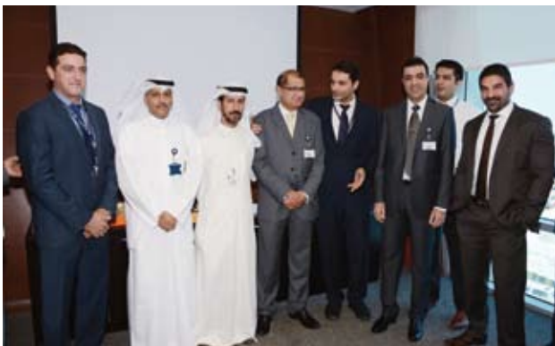
■ A memorial photo of the honoring ceremony