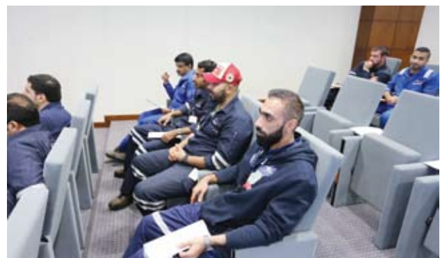
■ Another group of training participants