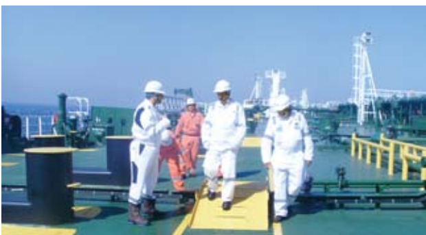
■ Onboard "Al Kout" vessel

It is worth mentioning that the Very Large Crude Carrier VLCC "Al Kout", was the best conclusion of the third phase of the fleet modernization plan and delivered to the company on October 2014, with capacity 2.2 million barrels, length overall (LOA) 333 m, extreme breadth (Beam) 60m, draft up to 22.5m and speed is 16.2 knots as it was registered by the Leading Classification Society Class NK on October 2014 to comply with the performance standard for design and operating efficiency and environmental preservation.