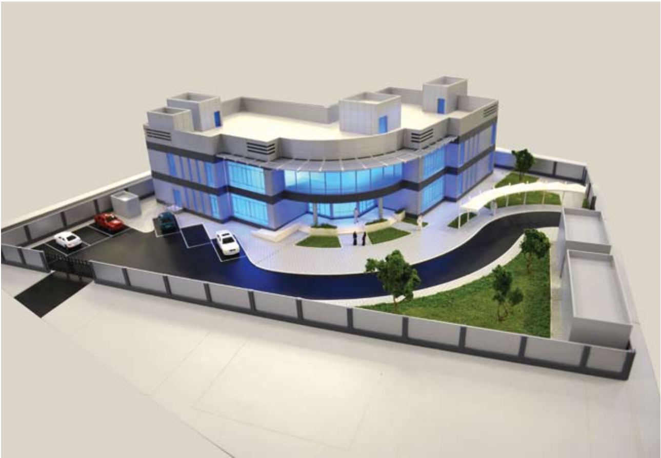
■ New administration building for LPG Filling Branch "Shuaiba"

company's operations and strategic plan in order to assist in work development and strengthen the prestigious position that company occupied regionally and globally.