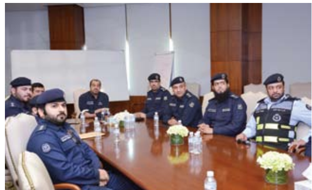
■ Visitors attending a presentation about HSSE systems on the plant