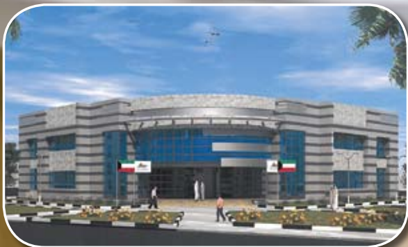
New Administration Building Project for LPG Filling Branch "Shuaiba"