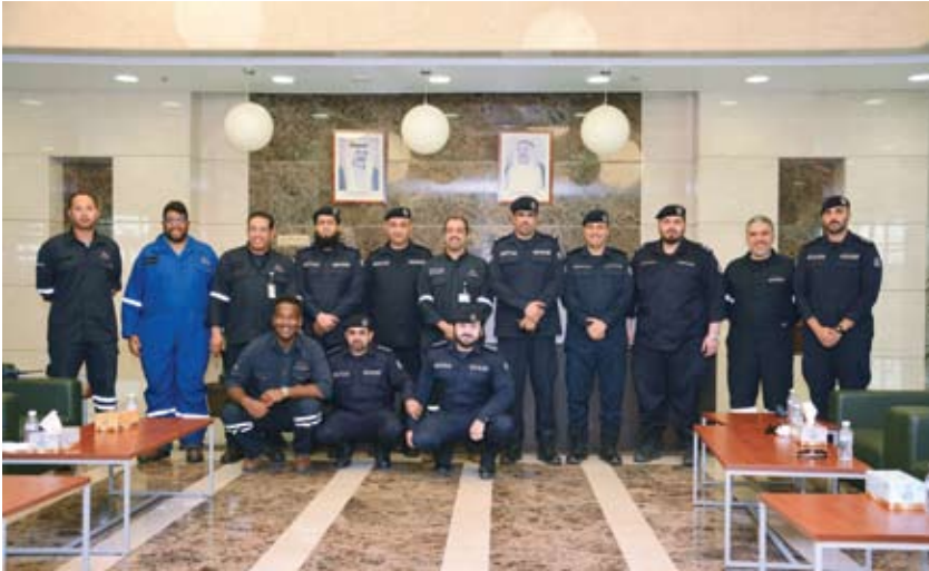
■ A memorial photo of LPG Filling Branch "Umm Al-Aish" and Kuwait Fire Service Directorate Officials

A team of Fire Prevention Sector from Kuwait Fire Service Directorate visited LPG Filling Factory "Umm Al-Aish" to inspect preventive requirements and firefighting systems, Umm Al-Aish liquefied petroleum gas (LPG) project is the first plant in the Middle East that uses the technology of 'Flex Speed' which products approximately 50.000 gas cylinder of 12 kg capacity per day.