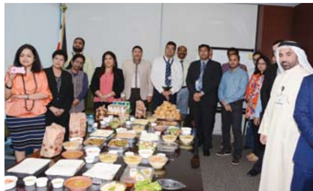
■ A group of participant's employees on the honoring ceremony