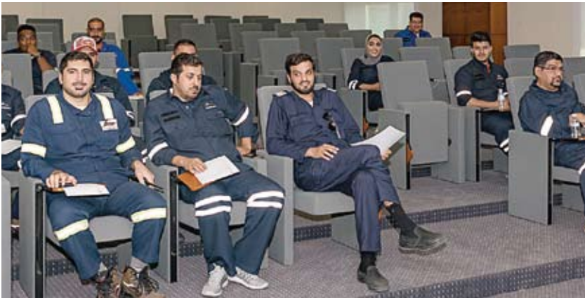
■ A group of training participants