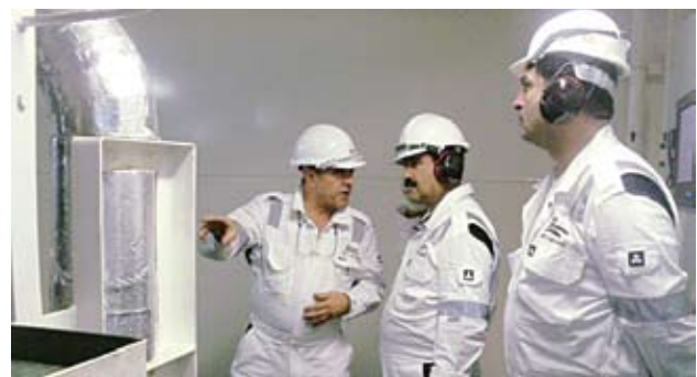
■ In the engine control room