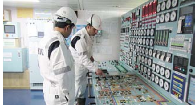
■ Inside the cargo control room