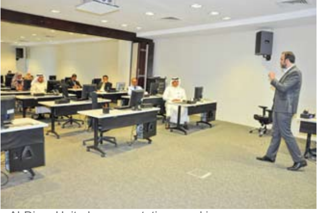
■ Al-Diyar United representative speaking