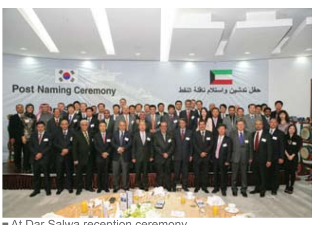
■ At Dar Salwa reception ceremony

commitment as well as the importance of teamwork. The administrative and fleet work. each have its own challenges and both complement each other. Through the administrative work, I exploit overseas experience. which gave me confidence and readiness to deal with all kinds of emergencies."