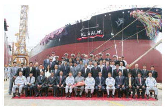
■ At Al-Salmi commissioning ceremony